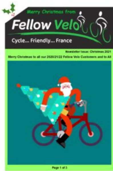
Page 1 of 3